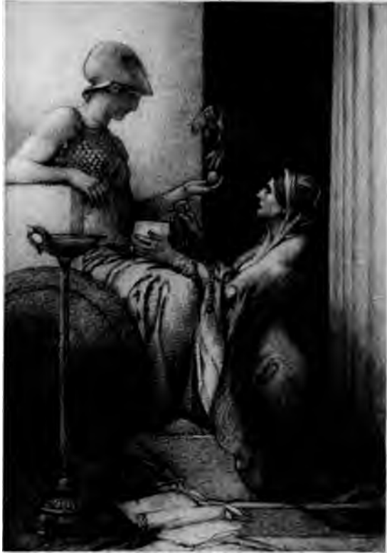
LELAND STANFORD JUNIOR UNIVERSITY